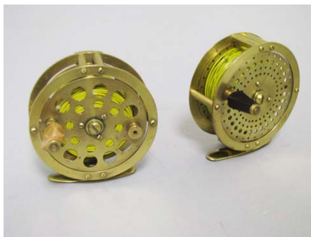
Figure 1: Peter Dallman's Reels

make our reels using only simple hand tools such as files, a hacksaw, sandpaper, and a hand-drill with various drill bit sizes, that's it. You can use any modern tool you want, we just chose to walk a different path to prove something to ourselves. John chose brass as his material. He explained that it is very similar to wood to work with and more durable than aluminum, cheap, and easy to find. I got my supply from the local Ace hardware store for $8. They carry a small supply of sheet and tube stock for hobbyists.