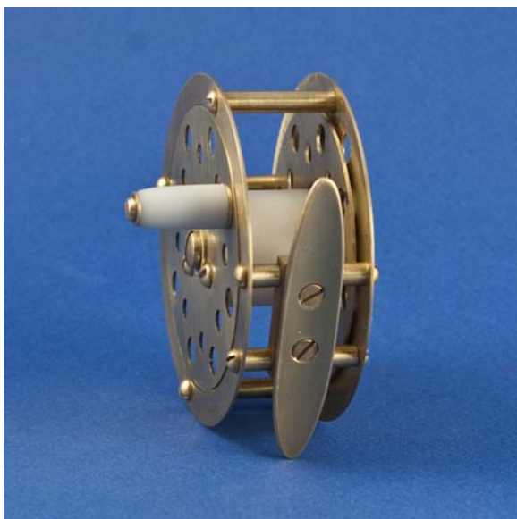
Figure 4: Reel Foot Detail