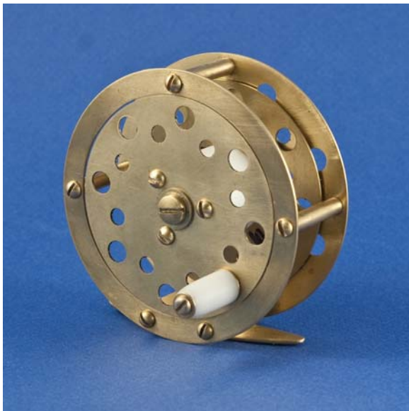
Figure 3: Reel Ready for Final Polish

graphs, revisions, and edits now. The book teaches new reelsmiths how to build the reel shown in Figures 3 through 5 . My journey also led me to create the Reelsmithing forum ( www.reelsmithing.com/forum ) as a community for reelsmiths to share information, designs, ask questions, and learn. Several reelsmiths have already posted photos of their completed reels and are exploring their own designs. If you are interested in reelsmithing, it is a great place to start.